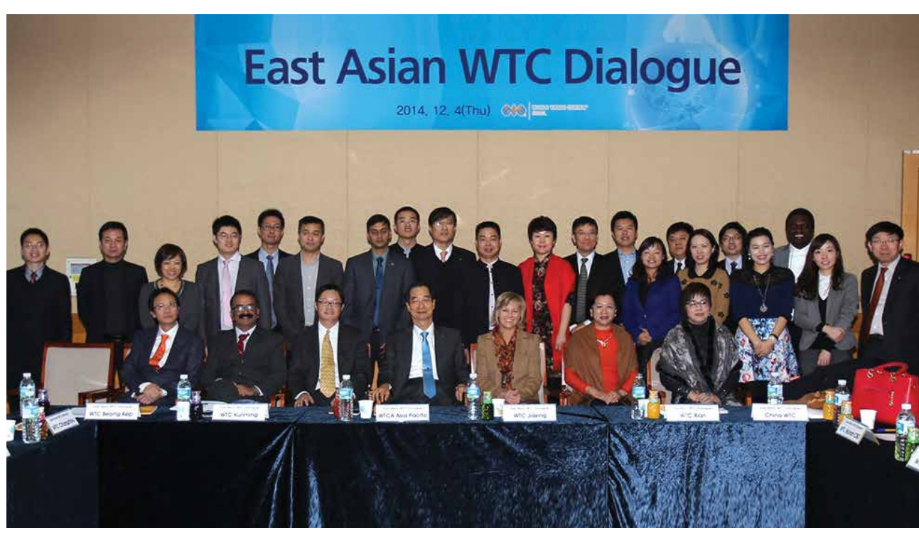
Delegates at the WTC East Asia Forum