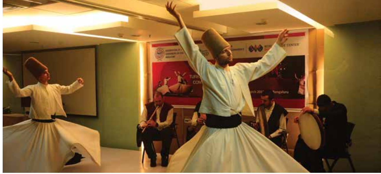
Sufi dance performance during the inaugural ceremony

Turkish Indian Chambers of Commerce and Industry (TICCI) in association with World Trade Center Bangalore and Federation of Karnataka Chambers of Commerce and Industry (FKCCI) organized an inaugural ceremony on 7th March, 2015 at the WTC Bangalore. The Turkish Indian Chamber of Commerce & Industry (TICCI) has opened an office in the city